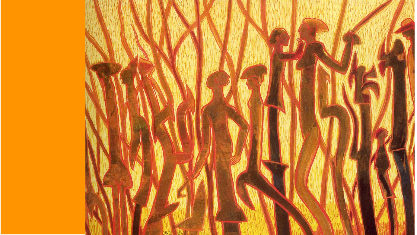
Sin Título/ Untitled 2002 Acrylic on canvas