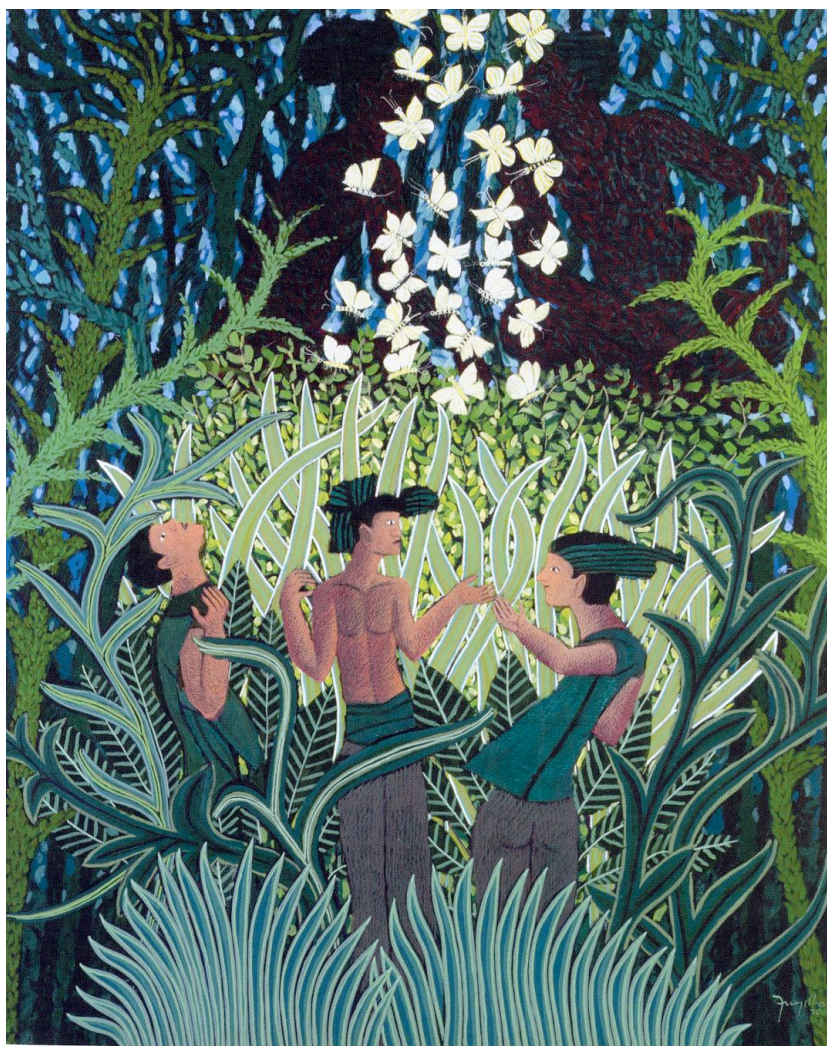
The Emberá Oracle 2000 Acrylic on canvas

His art brings us happiness because, in addition to beauty, he offers us hope. His paintings reconcile man with nature, creating a link between pre-Hispanic and contemporary art and extending a bridge between reality and fantasy.